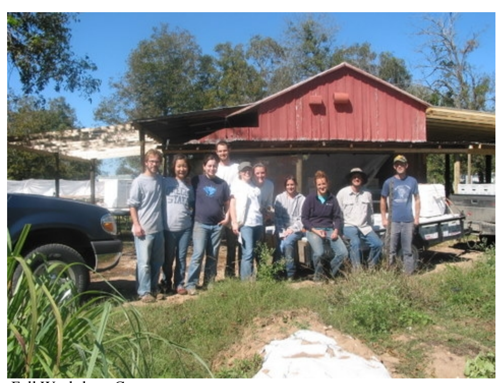
Fall Workshare Crew

Interested in work sharing this Winter? Our CSA is a little different than most in that veggies each week are harvested mostly by CSA members. If you are interested in having more involvement in the farm please e-mail us for information on our work share program. In exchange for working from 8-12:30 on Saturday mornings we provided a CSA share of veggies in trade. Our CSA is growing rapidly and we always need plenty of friendly and